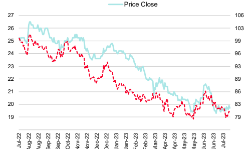
Charoen Pokphand Foods (CPF TB)